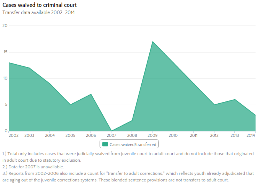
Figure 3.2: Cases Waived to Criminal Court

Figure 3.2 on the following page). Based on available data, waiver cases only made up about 3% of the total juvenile cases brought by the Solicitors. Thus, the likelihood that the excluded cases would have a significant effect on the data if included is marginal.